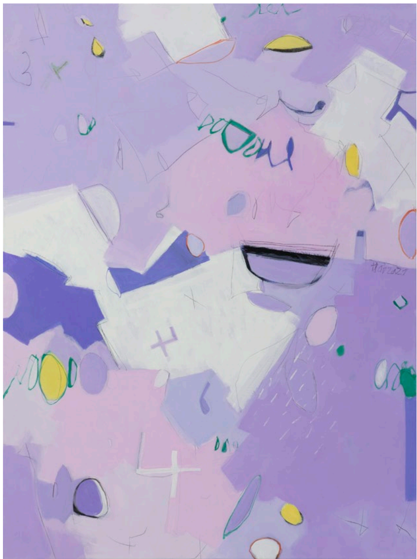
Breeze on the river #18 | Gió trên sông #18