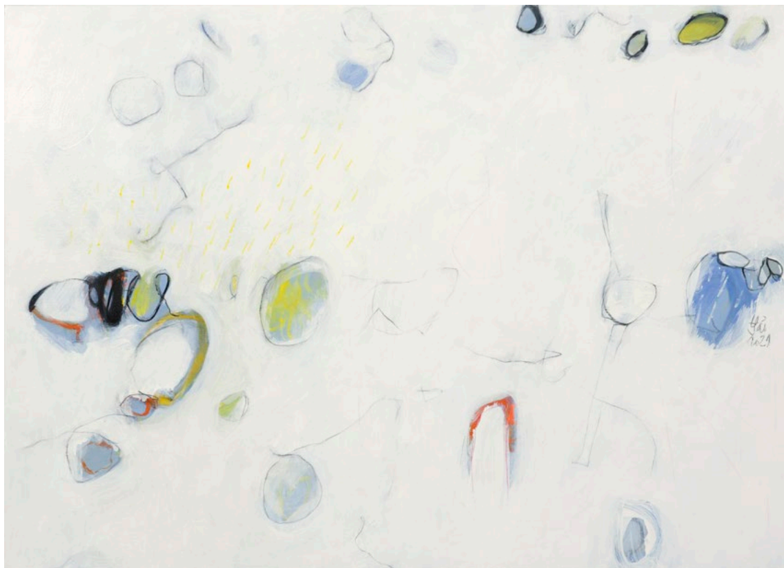
Breeze on the river #17 | Gió trên sông #17