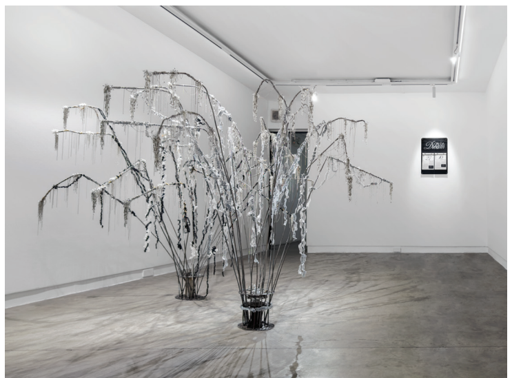
View of ON DA DREAM , 2024, Galerie Quynh, Ho Chi Minh City.