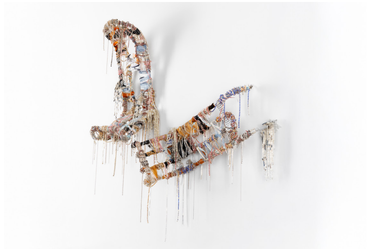
Fast 'n Secure 9 (diptych), 2024 motorbike center hanger rack, nickel-plated steel ball chain, metallic ribbon, satin ribbon, organza ribbon, rhinestone chain, rhinestone mesh, plastic beads and adhesive 19 3/4" x 21 1/4" x 6 3/4" | 50 x 54 x 17 cm

+84 28 3822 7218 info@galeriequynh.com www.galeriequynh.com